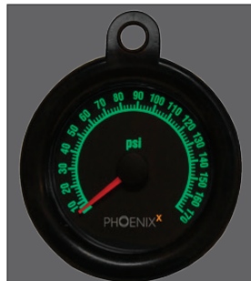
Backlit dial/needle is easy to read in low light conditions

To Order 800-998-9897 myerstiresupply.com